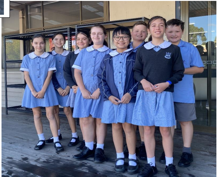
2023 Peer Tutors