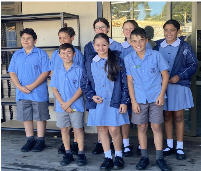
2023 Sport Captains