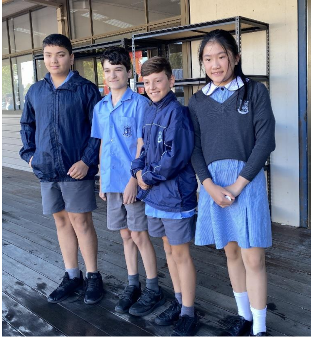
2023 ICT Captains