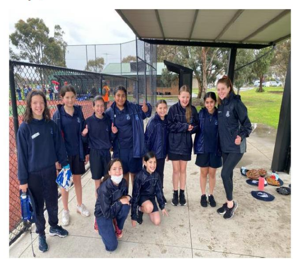
Division Finals - Runners Up