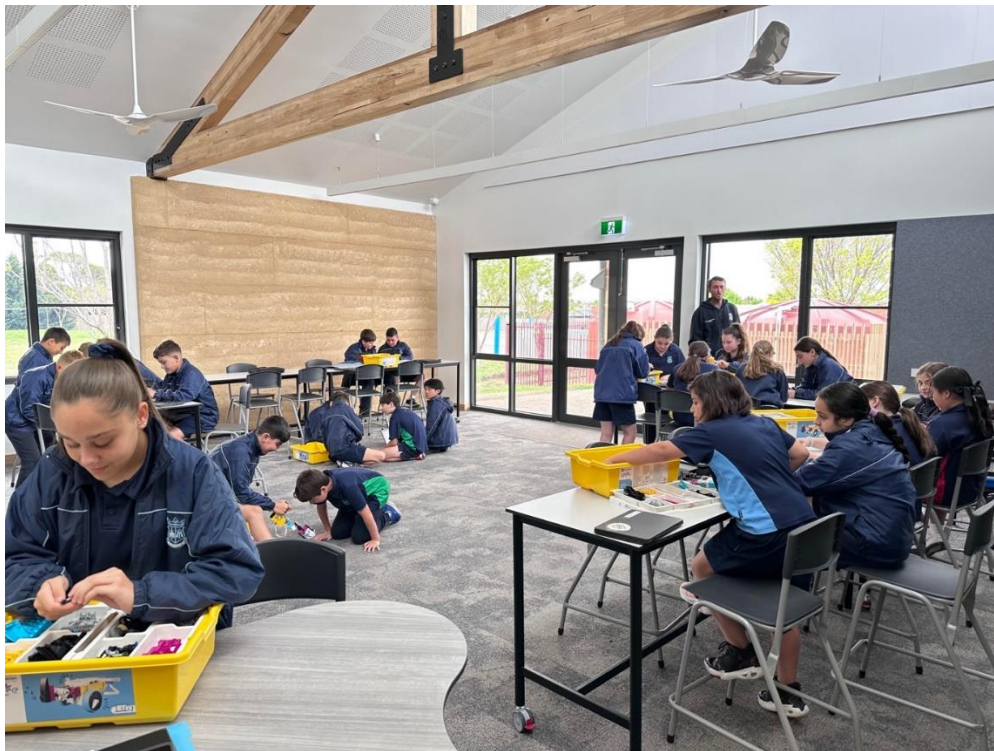
Digital Technologies Studio