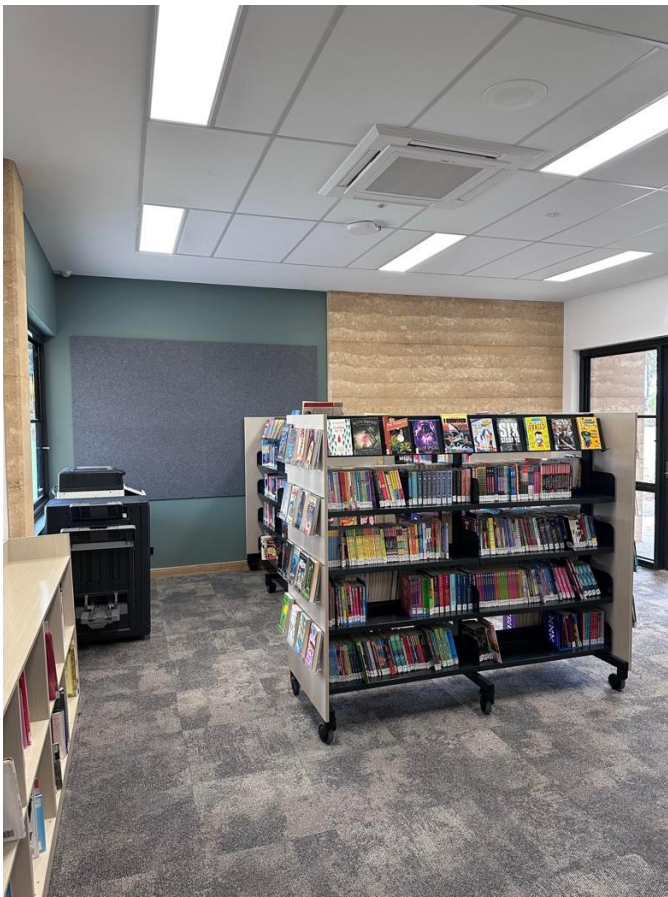
Book Space (still under construction)