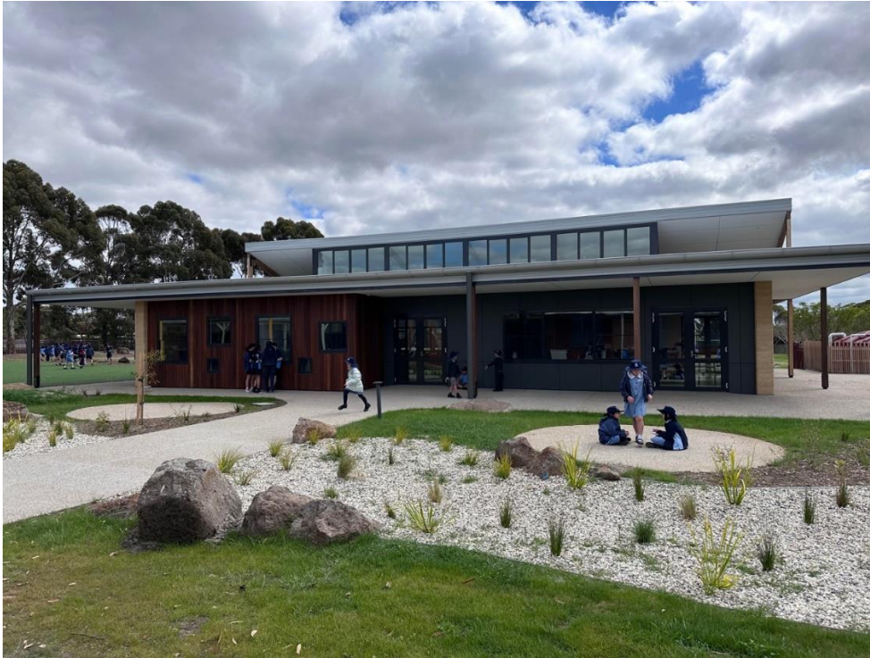
Looking towards Tenison Woods

Tenison Woods is now up and running. See some photos below.