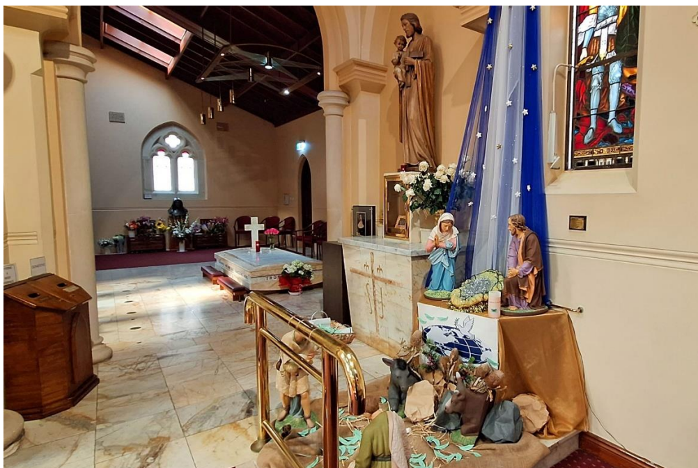
St. Joseph's Chapel, Nth Sydney with Mary MacKillop's tomb in the background.

We thank each of these staff members for their service to our school. We wish them the very best of wishes as they take up their new appointments.